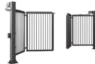
Round tube section infill 25 [mm] (welded to the structure)