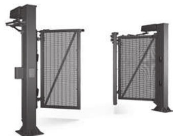
NEW VEGA Security panel infill (screwed to the structure)