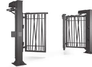
NEW AW.10.77 Infill. Round hollow section infill with a diameter of \varnothing 25