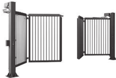
Section infill 25x25 [mm] in the Caro arrangement (welded to the structure)