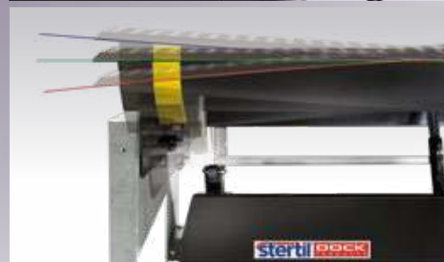
The platform can tilt 125 mm to both sides