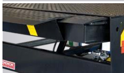
Side sections in the lip make the leveller suitable for both wide and narrow vehicles