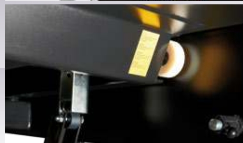
Two cross traffic legs