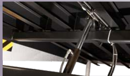
One hydraulic (main) cylinder