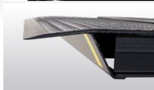
Lip angle is 5.5 degrees as standard